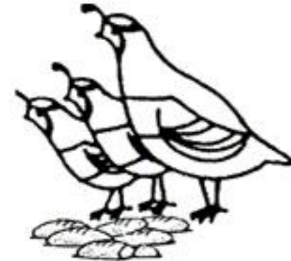
Manna & Quail